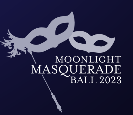
Table Sponsor - £2,000