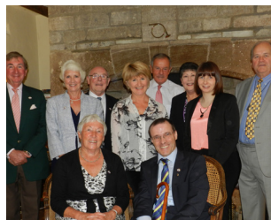
Our Ambassadors at the awards presentation