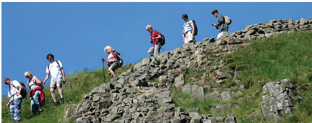
A group of walkers trekking alongside part of Hadrian's Wall, Northumberland

Hadrian's Wall originally ran from coast to coast and spanned 72 miles. Today we are left with only sections of this famous landmark, which cuts through Northumberland National Park. Starting at Lanercost Priory, we trek for 25 miles (41km) alongside the only remaining sections of the wall, admiring ancient monuments, beautiful scenery and the skill of the Roman engineers who built this famous landmark, now a UNESCO World Heritage Site.