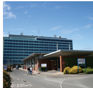
The Pilgrim Hospital in Boston which has recently undergone extensive redevelopment including a new Accident and Emergency Department and a £4 million state of the art Intensive Care Unit