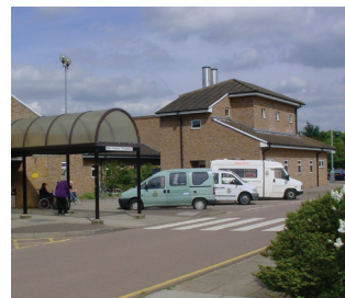
Grantham Hospital which is mainly an acute hospital built in 1874 and serves Grantham and the local area