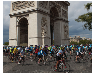
Cyclists on various legs of the London to Paris cycle ride - taking in beautiful countryside and sites in the capital city of Paris