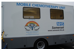
The Somerset Mobile Chemotherapy Unit 'Bumble'.

The Somerset Unit 'Bumble', operated by Taunton & Somerset NHS Foundation Trust, continues to visit Bridgwater and West Mendip Community Hospitals. Plans are currently underway to expand the service to another two locations in 2013.