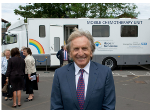
Patron Derek Bell MBE at the Hampshire Mobile Chemotherapy Unit launch

On the 1st August 2012 our fourth Mobile Chemotherapy Unit Amy is launched by Patron Derek Bell MBE at Andover War Memorial Hospital and is named in memory of the Earl of March's great grandmother. This Unit is operated by Hampshire Hospitals NHS Foundation Trust.