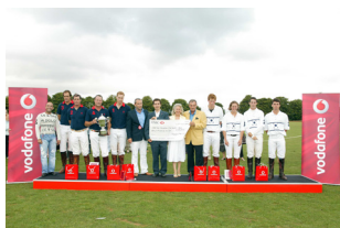
The cheque presentation on 29th July 2006 at our first Charity Polo Day

On the 29th July 2006 the Mobile Chemotherapy Unit project is announced at our 1st Charity Polo Day at Beaufort Polo Club, Westonbirt. The 6th July 2013 will mark our 8th annual event.