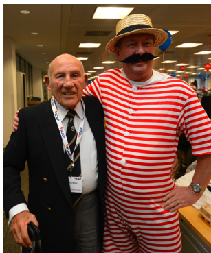
Sir Stirling Moss OBE and ICAP employee

Over 60 offices worldwide took part supporting over 200 charities and an incredible £11 million was raised.