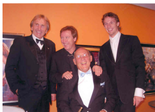
L-R Derek Bell MBE, Kenny Jones, Sir Stirling Moss OBE and Jenson Button MBE