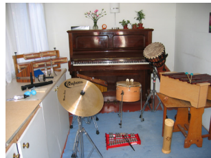
The picture above shows the instruments that were purchased for the children

The charity commences work on its first projects, including 'The Road to Communicating with Cancer' information leaflet, providing pagers to the Oncology Units at Bath & Cheltenham for patient use along with portable DVD Players & DVD's, and raising funds to provide musical instruments to the Rainbow Centre, a children's cancer charity.