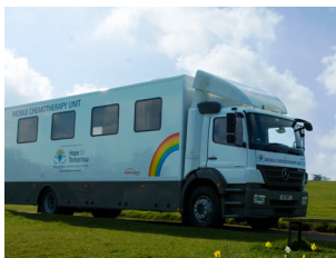
Our Gloucestershire Mobile Chemotherapy Unit 'Helen'.