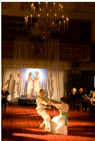
Studio 7 performs at our Gala Dinner in 2008

We held our Gala Dinner and an eco-friendly Fashion Show on the 25th November 2008 at the Clothworker's Hall, London having been the charity nominated to use it that year, having also received a generous grant from the Clothworker's towards our Mobile Chemotherapy Unit expansion project.