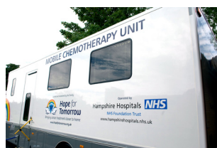
'Amy' our Hampshire Mobile Chemotherapy Unit

The Hampshire Unit 'Amy' has been busy since its launch back on the 1st August 2012. The Unit operates three days a week in Andover, Alton, Tadley and Hartley Wintney, with Eastleigh being added in 2013. Patients have commented on the convenience of the service, the friendly atmosphere and being able to have treatments on board saving them a long trip and money for fuel. The nursing team have also received a great response.