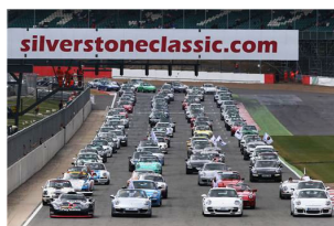
Pictured: The 911 Parade at Silverstone which celebrated the 50th Anniversary of the iconic sports car

So far the event has raised £10,000 and we'd like to thank Porsche Club GB for choosing us as their charity partner for this event.