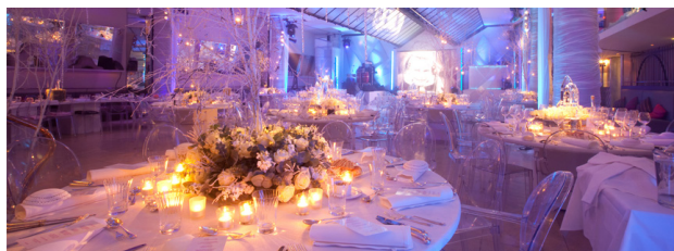
Pictured: Quaglino's in London

You may have heard(!) that this year we are celebrating 10 years of supporting cancer patients. As well as marking the occasion with a variety of events and activities, we are also hosting a Gala Dinner at Quaglino's in London. The evening will begin with a Champagne reception, followed by dinner and entertainment. Sir Jeffrey Archer is kindly hosting our Live Auction, which we hope will raise some fantastic funds on the night. Tickets are on sale now and can be bought individually or as tables of 10. Sponsorship packages are also available. Please visit our website for more information and where booking forms are available to download.