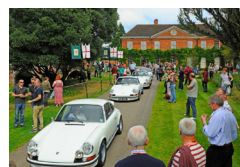
Pictured: A few photos from previous 'Classics at the Castle' events