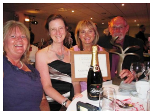
Members of the Somerset Mobile Chemotherapy Unit Team enjoying themselves at the dinner.