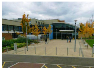
Pictured above: Fleming Park Leisure Centre, Eastleigh