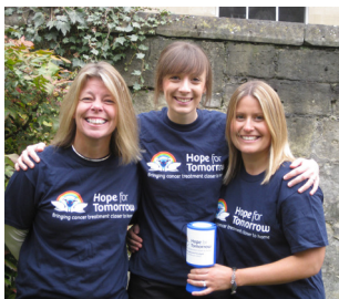
The Appoint ladies proudly wearing their Hope for Tomorrow T-shirts at their office in Bath