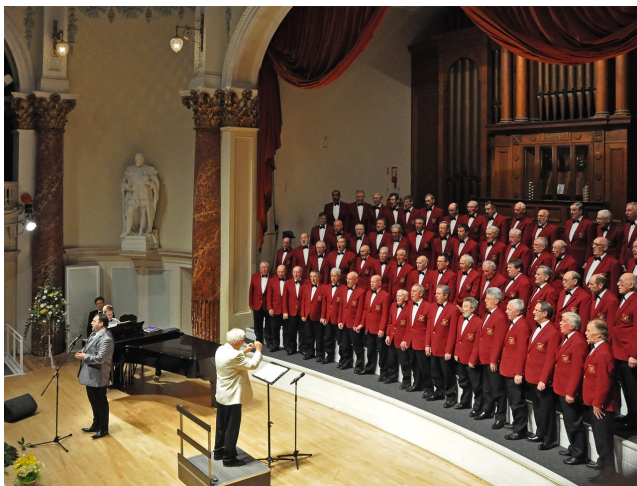
Wynne Evans and the Dursley Male Voice Choir performing at Cheltenham Town Hall for the concert in aid of Hope for Tomorrow

On Saturday 23rd March, the Dursley Male Voice Choir performed a magnificent concert in aid of Hope for Tomorrow. Also performing was Wynne Evans, the Welsh tenor who is known for being the face and voice of the advert comparison website GoCompare.com, playing the flamboyant character 'Gio Compario'. They sang a variety of songs from 'You Raise Me Up' to 'Love Changes Everything' and Wynne even performed 'The Lord's Prayer' in Welsh. It was a memorable evening for everyone involved, with supporters coming from all over Gloucestershire.