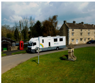
One of our Mobile Chemotherapy Units travelling through a rural village