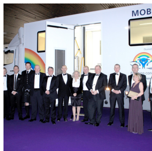
Above: the winners in front of a Hope for Tomorrow Mobile Chemotherapy Unit

Each year our corporate partner Pendragon PLC holds an award ceremony for their staff at Evans Halshaw, Stratstone and Quicks. During the evening, the guests play a game of 'Heads & Tails' where each player pays to enter for the chance of winning a prize. This money was donated to us and the three events raised a total of £6781.72 which was absolutely fantastic. We'd like to take this opportunity to thank all the staff and team members for such wonderful evenings.