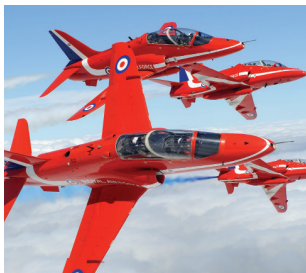
Photo of the Red Arrows doing a display at a previous Royal International Air Tattoo

The Royal International Air Tattoo held at RAF Fairford, Gloucestershire, is the world's largest military airshow. Over the years it has gained the well-earned reputation as one of the UK's top outdoor family events, drawing in 150,000 to 160,000 spectators over the weekend. This year, we are delighted to be involved with the Vintage Village section of the event - more details on this coming soon! We'll also be taking one of our Mobile Chemotherapy Units. If you would like to come along, tickets are £45.00 per day, or £75.00 for a weekend ticket and kids go absolutely free! They can be purchased through the the website ( www.airtattoo.com ).